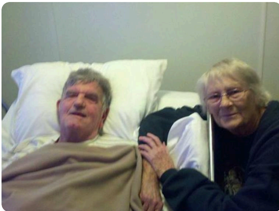
mom and dad