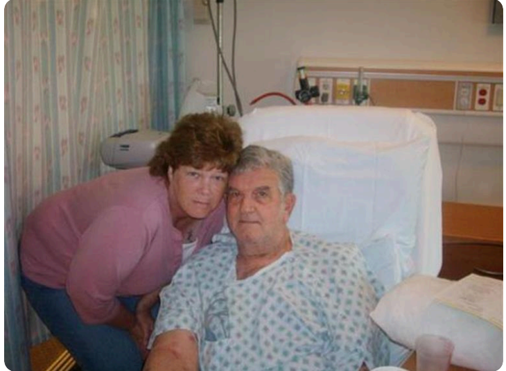
me and dad