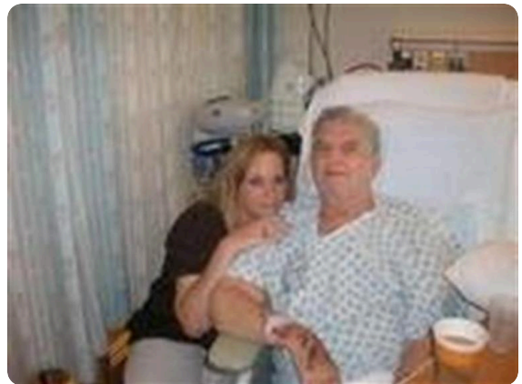
cris and dad